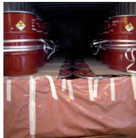
Drums packed inside 20' ISO