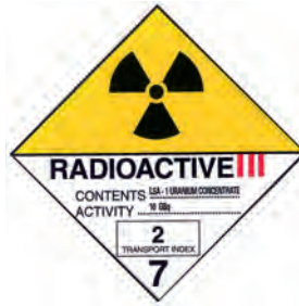
Typical Class 7 drum label

UOC shipping containers must be placarded in accordance with the International Maritime Dangerous Goods (IMDG) Code.