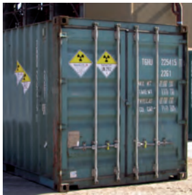
20' GP ISO shipping container