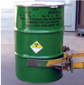
UOC drum with Class 7 labelling