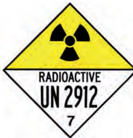
UN2912 Class 7 label

As for all dangerous goods, a multi-modal dangerous goods form must be completed for each shipping container.