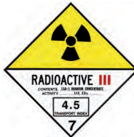
Category III Yellow label